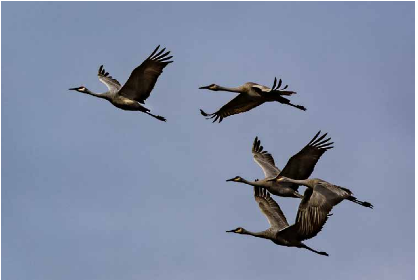
Title: Birds of Hope and Peace