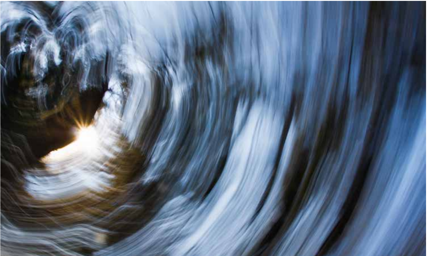
Title: Light of Song "But music and singing have been my refuge and music and singing shall be my light." (Frank Ticheli)