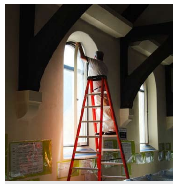
All of the windows in the Sanctuary, Ames Chapel, and Parish Hall are being restored.