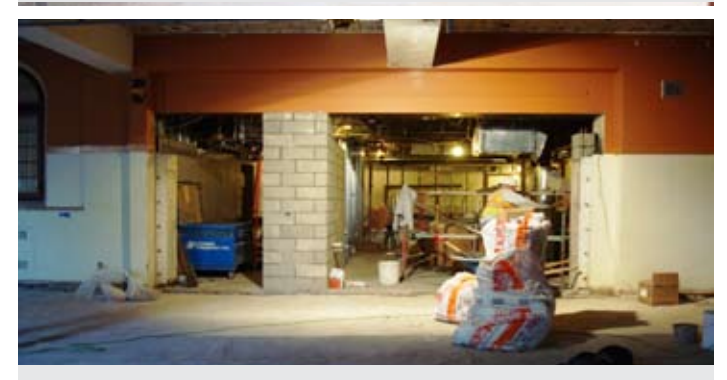
The kitchen (right) and hallway (left) begin to take shape.