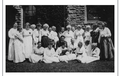
Women's group, Unity Church

Saturday, March 13 10:15 a.m. Following the pancake breakfast.