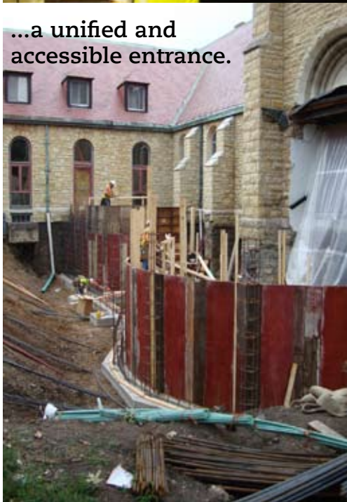
...a unified and accessible entrance.