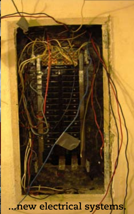
...new electrical systems.