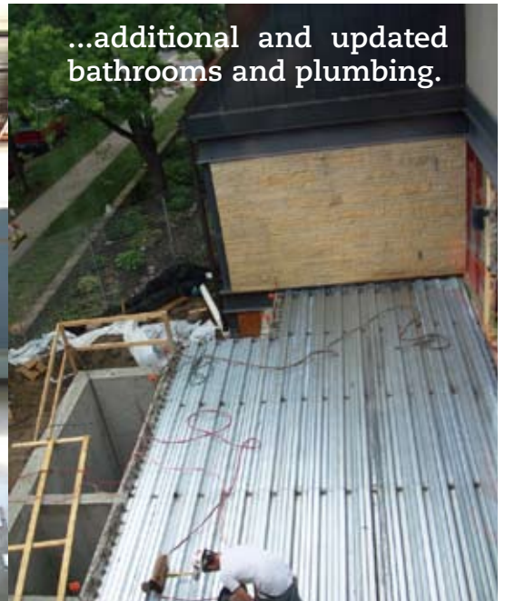
...additional and updated bathrooms and plumbing.