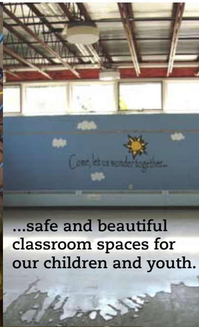
...safe and beautiful classroom spaces for our children and youth.