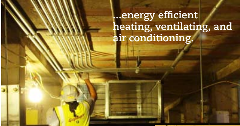
...energy efficient heating, ventilating, and air conditioning.