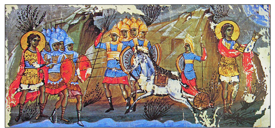
Israelis taken prisoner by the Canaanites in water Merom, Byzantine manuscript, 13th Century BCE

Moses dies at the age of 120 on Mount Nebo. God buries him in a valley. In place of Moses, Joshua was called by God to lead the people of Israel to the promised land.